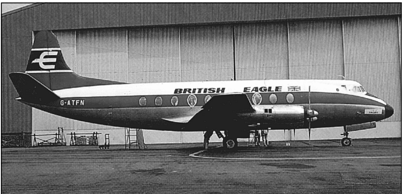
The ill-fated British Eagle Viscount G-ATFN, City of Truro

The electrical system on the Viscount consisted of 4 generators powered by the engines and 4 batteries feeding a main busbar (common rail) with DC power via control circuits. This busbar fed various services and instruments on the aircraft with DC